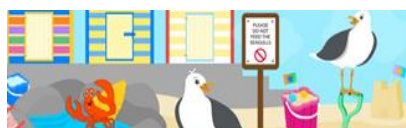
The Doodle Summer Challenge 1st of July - 31st of August 2025

We're excited to share that our school will be taking part in the Doodle Summer Challenge ! Running from now and throughout the summer holidays, this challenge encourages children to keep up their maths and English skills in a fun and engaging way by using the award-winning Doodle Learning apps. Just a few minutes a day can help children stay on track and return to school confident and ready for the new term. All