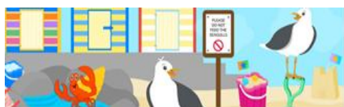
The Doodle Summer Challenge 1st of July - 31st of August 2025

We're excited to share that our school will be taking part in the Doodle Summer Challenge ! Running from now and throughout the summer holidays, this challenge encourages children to keep up their maths and English skills in a fun and engaging way by using the award-winning Doodle Learning apps. Just a few minutes a day can help children stay on track and return to school confident and ready for the new term. All children